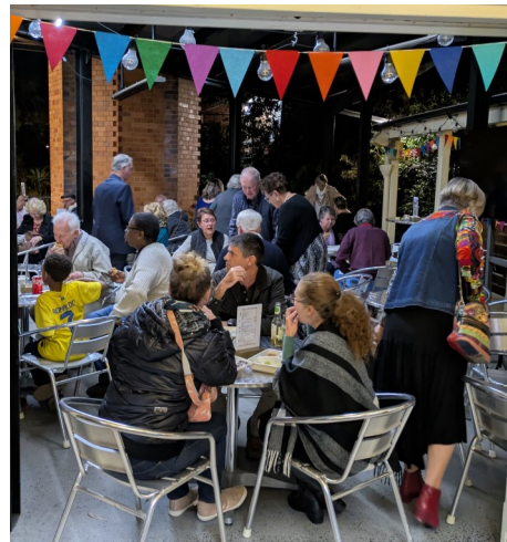
After the show, time to relax and enjoy a bite to eat and a chance to evaluate.